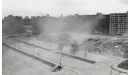
Figure 1. The widely televised demolition sequence of Pruitt-Igoe, widely seen as the end of Modernism. This can be understood as a form of 'creative destruction.' by U.S. Department of Housing and Urban Development, April 1972. (Source: http://en.wikipedia.org/wiki/File:Pruitt-igoe_collapse-series.jpg).

so. The explication of Landscape Urbanism's genealogy, its engendering socioeconomic structure, how it evolved, and how it operates—specifically as a form of adjectival urbanism—will reveal some of the core values and roles adjectival urbanism holds that can assist architects to theorize, thus equipping them with new conceptual tools to rigorously understand the city.